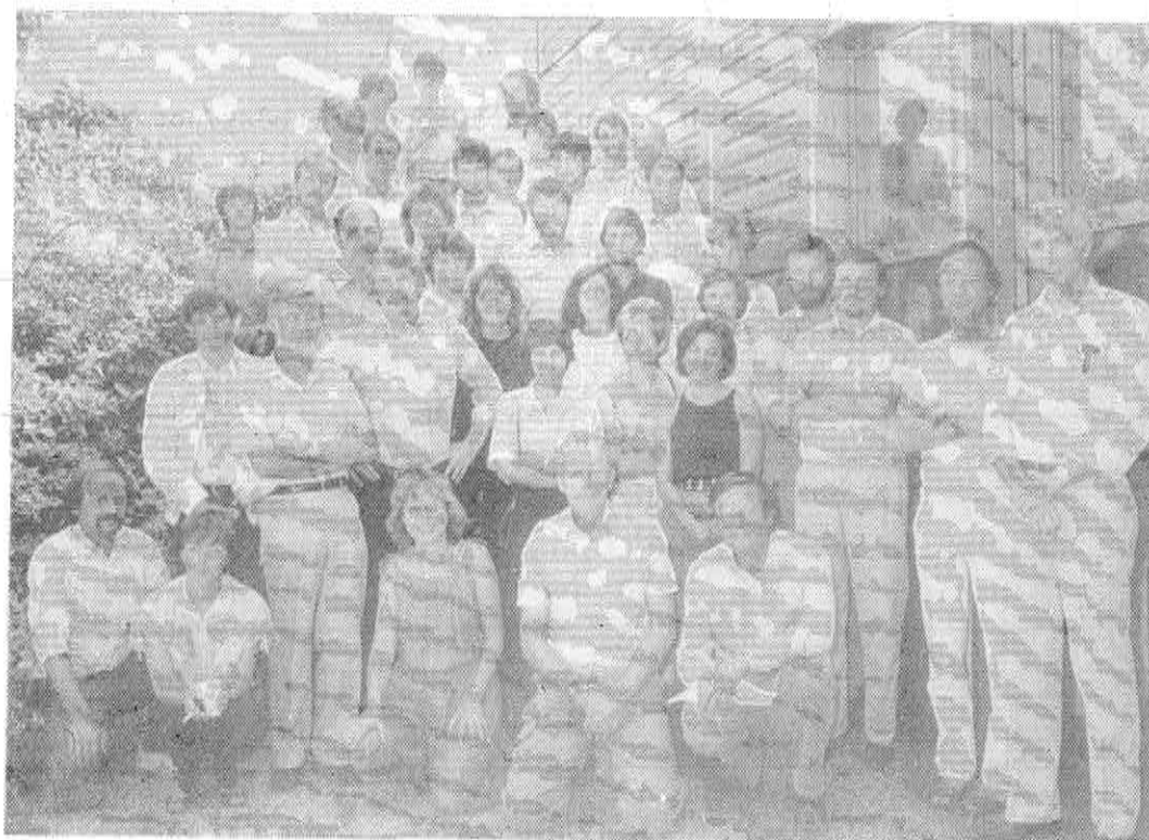
"A high density patch of nematodologists!"