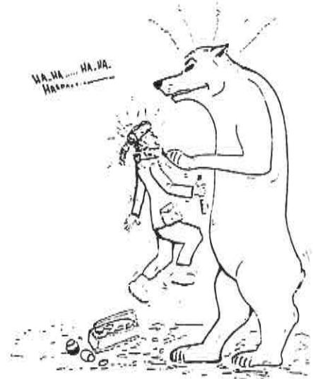
Rudy Herman's view of your editor sampling in Alaska