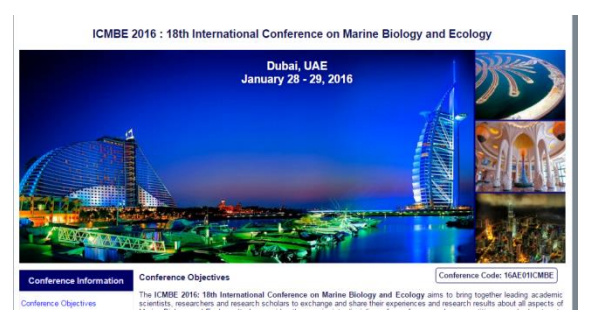
ICMBE 2016: 18th International Conference on Marine Biology and Ecology