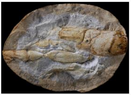
Glyphea regleyana (Desmarest, 1822)